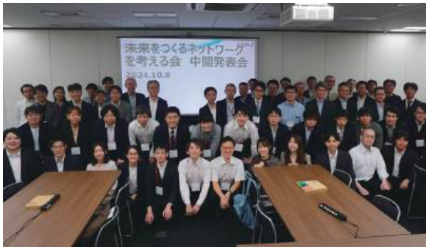
Cross-generational discussion in the "Workshop for a Network to Create the Future."

The objective is to support the human resources development and solve regional issues through wireless technology demonstrations by students.