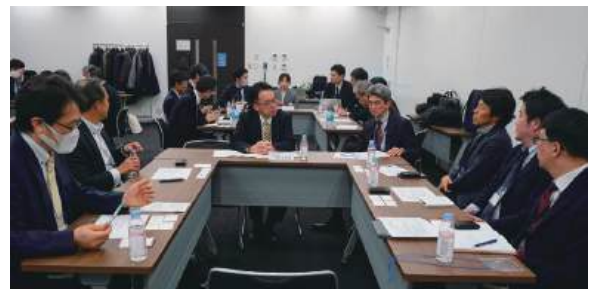
Opinion-exchange meeting on APN between CIAJ and Japanese government in January 2025.

Toward the realization of the "next-generation information and communications infrastructure," we are working with relevant government ministries and telecommunications carriers to quickly bring all photonics networks(APN) into society.