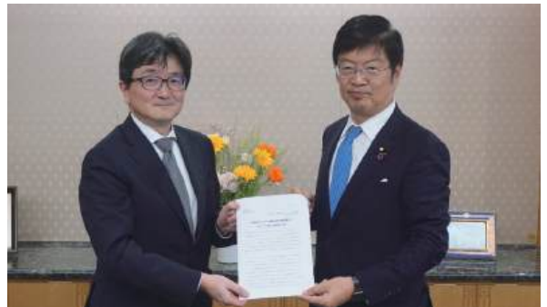
The Chairman submitted a CIAJ policy proposal to Parliamentary Vice-Minister of Internal Affairs and Communications in May 2025.

CIAJ compiles its members' opinions on major government policies and submits a "Request for the Information and Communications Network Industry" to the Ministers of the Ministry of Internal Affairs and Communications, the Ministry of Economy, Trade and Industry, and the Digital Agency every year.