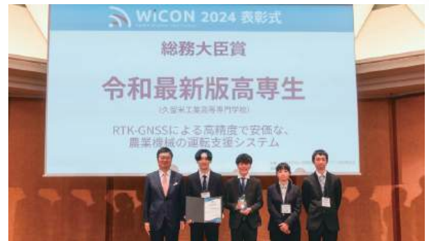
Minister of Internal Affairs and Communications Award Team in the "WiCON 2024."