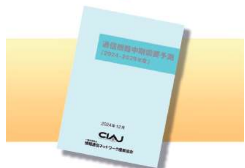
Publication of "Mid-term Demand Forecast for Telecommunications Equipment."

Statistical data and market trend surveys on telecommunications equipment are used by companies as information on industry trends for business planning and policy recommendations.