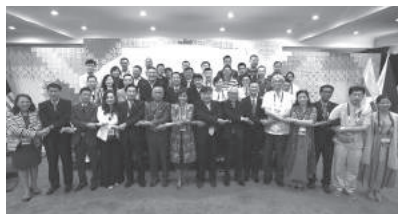
13th Asia Electrics Forum (AEF) in the Philippines where the Asian ICT Industry gathers once a year.

Taking the lead in addressing environmental issues, enhancing safety and reliability and other industry-wide challenges. Actual initiatives cover decreasing the industry's carbon footprint to ease global warming, promoting the recycling of mobile phones, raising awareness of network security and establishing communication accessibility for all.