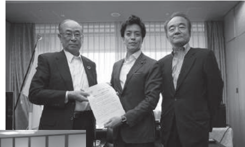
The Chairman and President submitted a CIAJ proposal to Parliamentary Vice-Minister of Internal Affairs and Communications on May 18th 2018.

Presenting industry views to relevant government ministries and agencies, with an emphasis on new market creation, enhancing global competitiveness and nurturing human resources. Specific proposals included combined applications of IoT and wireless technologies as well as support for global trade initiatives.