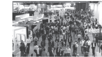
CEATEC JAPAN 2017 at Makuhari Messe in October with 152,066 visitors and 667 exhibitors.