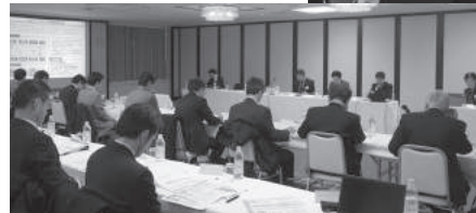
Opinion-exchange meeting on mobile business between CIAJ and Japanese government in Feb. 2018.