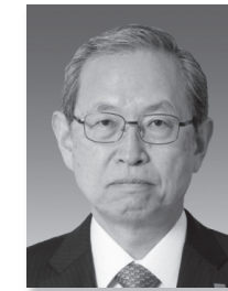
Satoshi Tsunakawa President, Toshiba Corporation